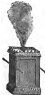
THE "GOLDEN ALTAR."

Opposite the "Table of Shew-bread" stood the "Candlestick," made of pure gold, beaten work (hammered