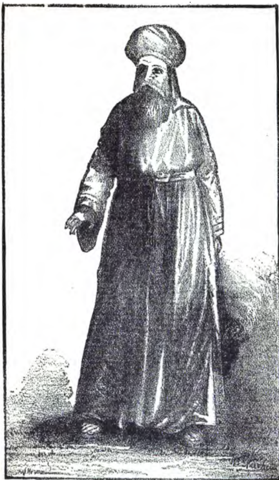
A PRIEST—IN LINEN GARMENTS.