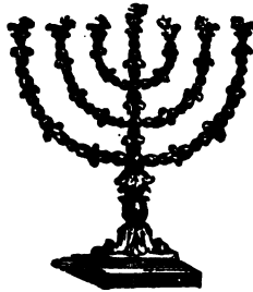
THE GOLDEN CANDLESTICK.

Within the Tabernacle, in the first apartment, the "Holy," on the right (north), stood the Table of "Shew-bread"—a wooden table overlaid with gold; and upon it were placed twelve cakes of unleavened bread in two piles, with frankincense on top of each [pile. (Lev. 24:6, 7.)