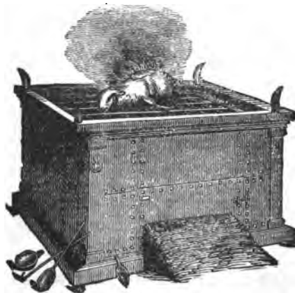
THE BRAZEN ALTAR.

It will be noticed that the three entrance passages, viz. , the "Gate" into the "Court," the "Door," into the "Holy," and the "Vail" into the "Most Holy," were of the same material and colors. Outside the Tabernacle and its "Court" was the "Camp" of Israel surrounding it on all sides at a respectful distance.