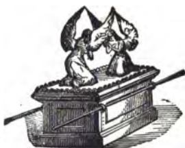
THE ARK OF THE TESTIMONY.

Further on, close up to the "Vail," stood a small altar, of wood covered with gold, called the "Golden Altar" or "Incense Altar." It had no fire upon it except when the priests brought it in the censers which they set in the top of this "Golden Altar," and then crumbled the incense upon it, causing it to give forth a fragrant smoke or perfume, which filling the "Holy" penetrated also beyond the "second vail" into the Most Holy or Holy of Holies.