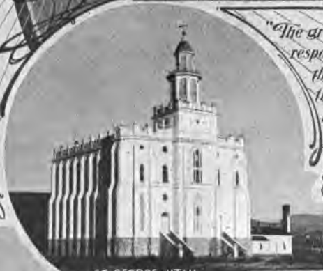
ST. GEORGE, UTAH.

"The greatest responsibility in this world that God has laid upon us is to seek after our dead."