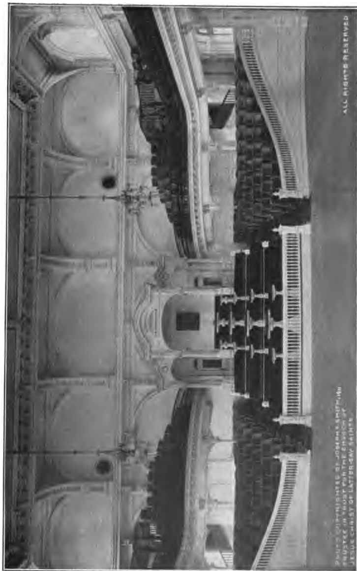
GENERAL ASSEMBLY ROOM

PAINTED BY THE ARTIST OF THE CHURCH OF THE LATTER DAY SAINTS JESUS CHRIST OF LATTER DAY SAINTS