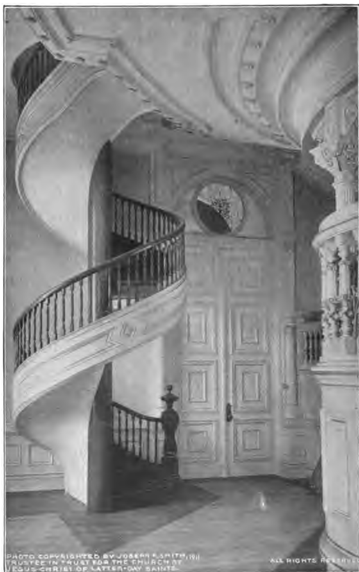
ONE OF THE SPIRAL STAIRCASES IN THE CORNERS OF GENERAL ASSEMBLY ROOM LEADING TO GALLERIES