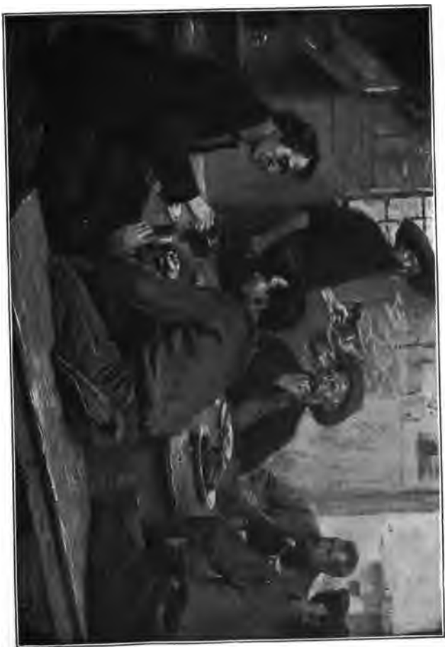
HERE WAS ROMANCE