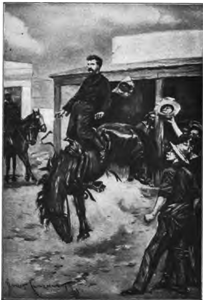
RIDING A BUCKING BRONCHO