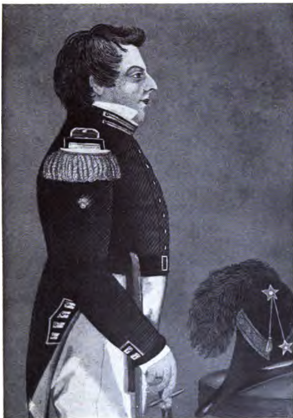
GENERAL JOSEPH SMITH Commander of the Nauvoo Legion