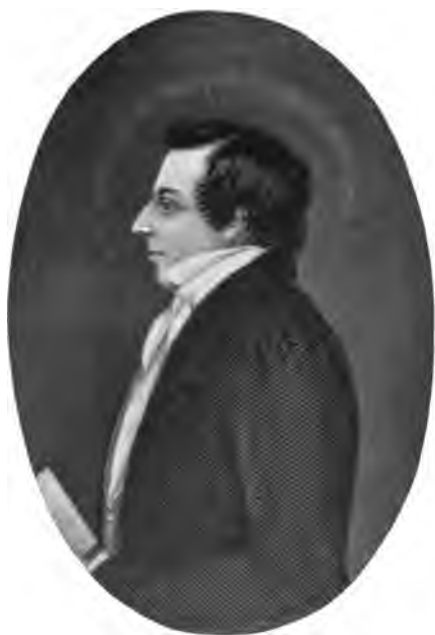
JOSEPH SMITH, JUNIOR

From the official portrait in Salt Lake City