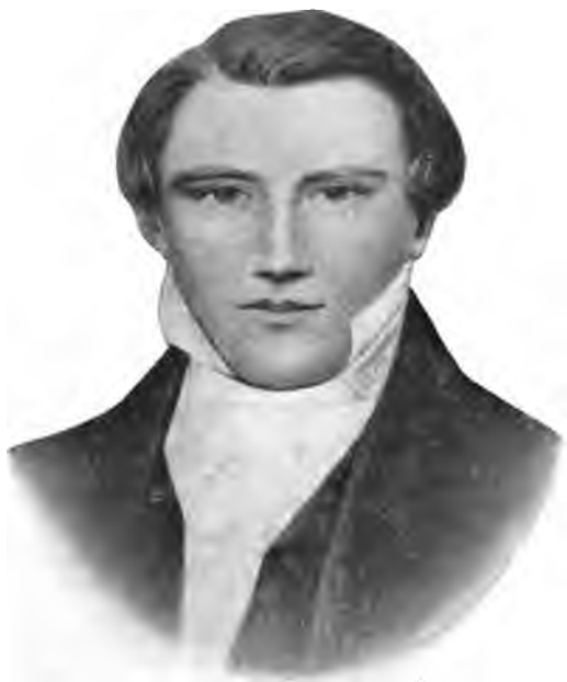
JOSEPH SMITH, Jr., THE "PROPHET."