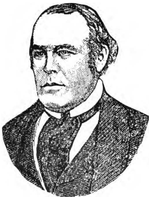
PARLEY PARKER PRATT.